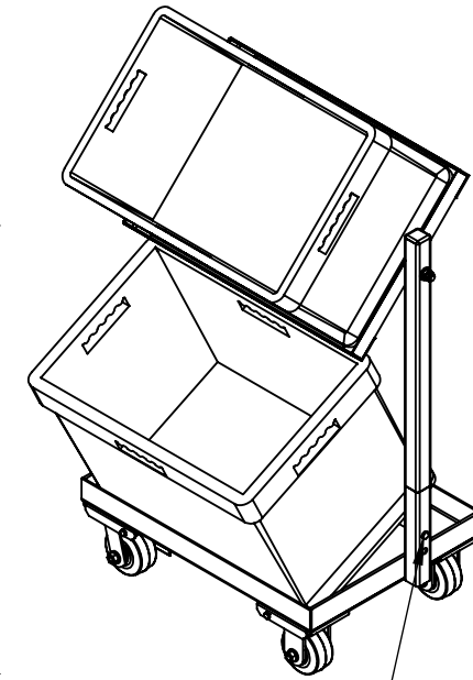
3-D VIEW SHOWN WITH LOWER PINS INSTALLED