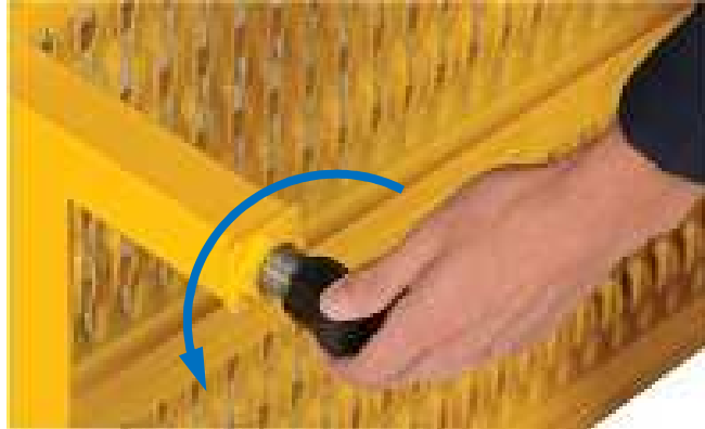
Turn leg counterclockwise to increase platform height

Each leg is independently adjustable. To extend the legs and increase platform height, turn the legs counterclockwise. To reduce platform height, turn the legs clockwise. After adjusting the legs, set the platform on its feet. Check platform levelness and adjust the legs as needed to make the platform level. Do not use the platform unless it is level.