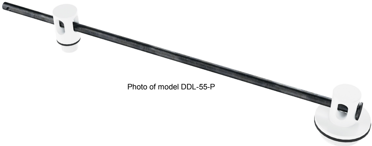
Photo of model DDL-55-P